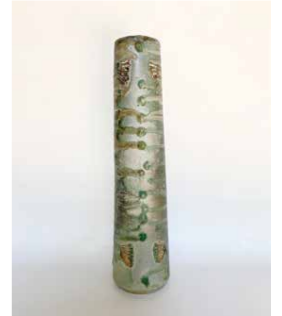
Biidoro (dragon eye) cylinder 4 Shino & ash glazes Porcelain Wood fired, 12 d x 48 h