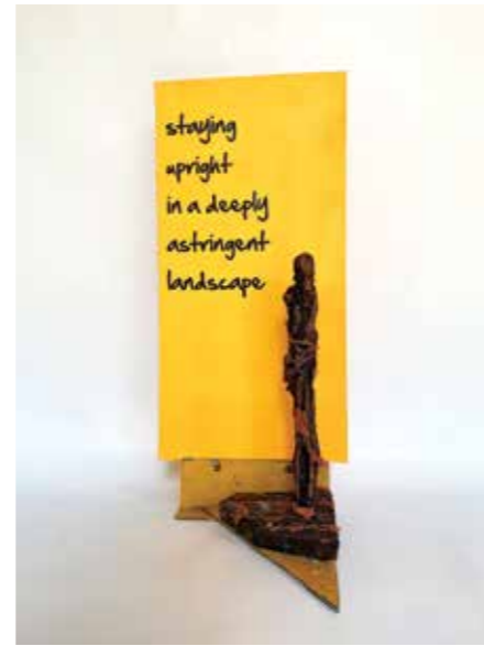
Extract 8 - staying upright Glazed ceramic, steel & mixed media Stoneware Mid fired, 24 w x 25 d x 56 h