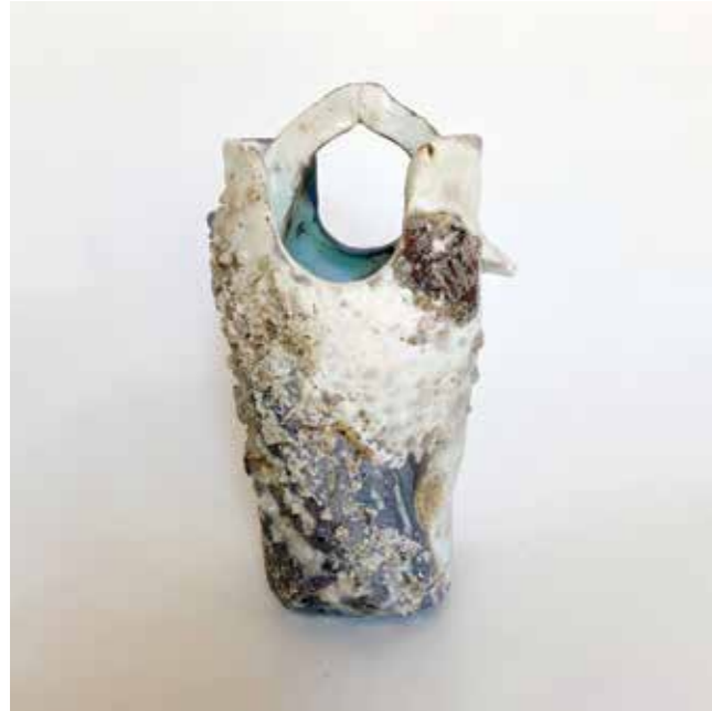
Firebox pail Natural ash glaze, side fired on shells Porcelain Wood fired, 10 d x 17 h