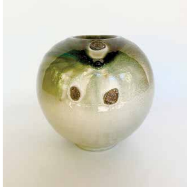
Orb - small Iron green & ash glaze, side fired on shells Porcelain Multiple firings, 23 d x 22 h