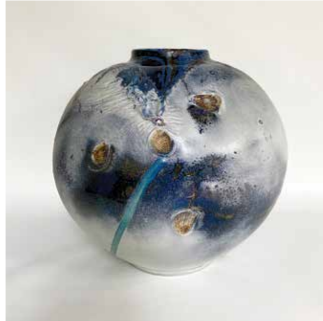
Large orb - matt Iron blue & ash glazes, side fired on shells Porcelain Wood fired, 37 d x 36 h