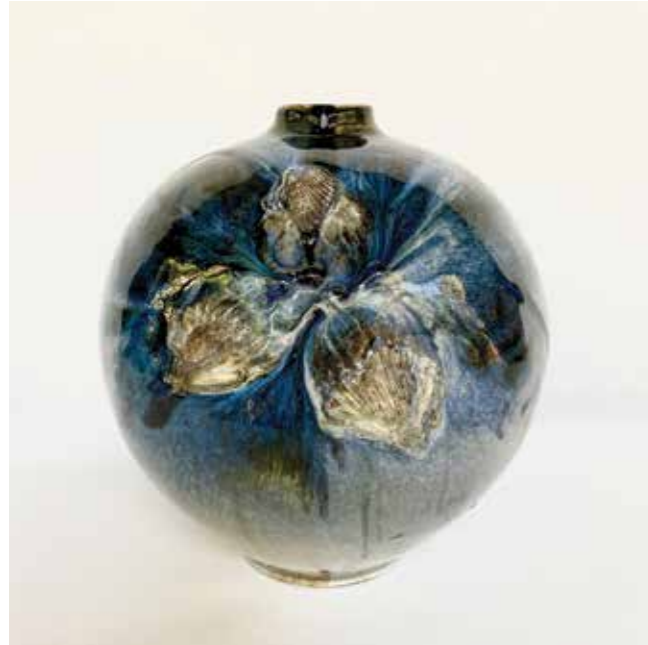
Medium orb Iron blue & ash glazes, side fired on shells Porcelain Multiple firings, 32 d x 32 h