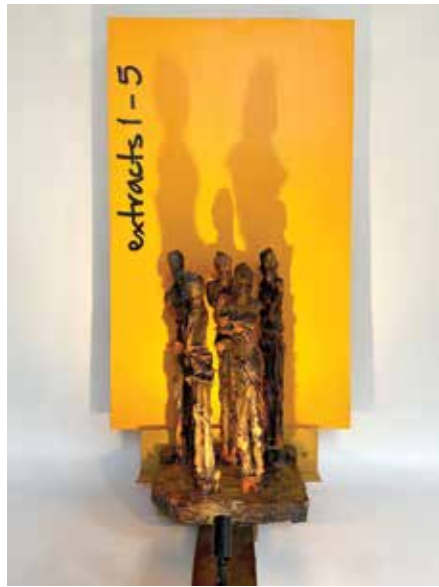
Extracts 1 - 5 Glazed ceramic, steel & mixed media Stoneware Mid fired, 36 w x 18 d x 67 h