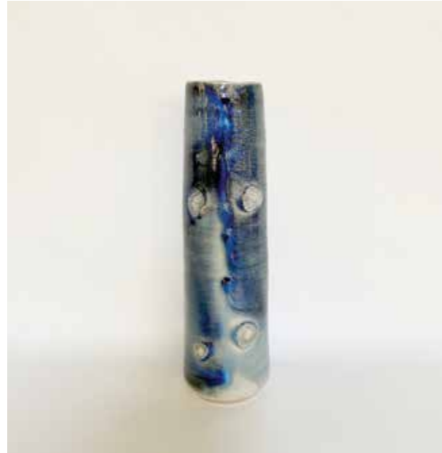
Biidoro (dragon eye) cylinder 1 Cobalt, iron & ash glazes, side fired on shells Porcelain Multiple firings, 10 d x 36 h