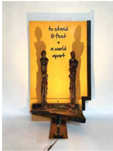
Extracts 6 & 7 - six feet Glazed ceramic, steel & mixed media Stoneware Mid fired, 33 w x 18 d x 50 h