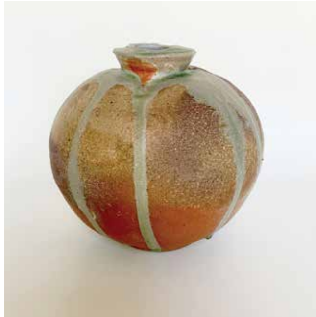
Iga style Round Jar 1 Wood ash & flame marked Stoneware Wood fired, 20 d x 19 h