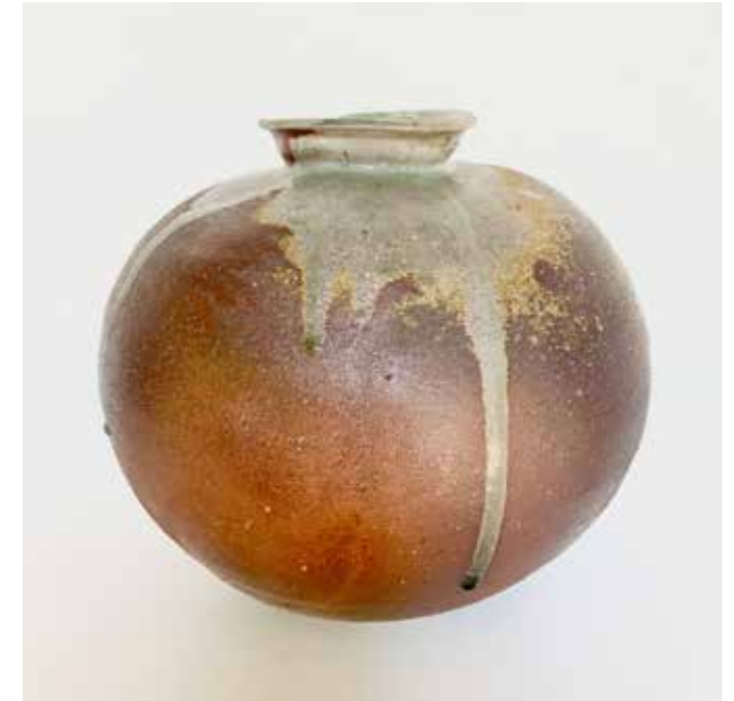
Iga style Round Jar 4 Wood ash & flame marked Stoneware Wood fired, 27 d x 25 h