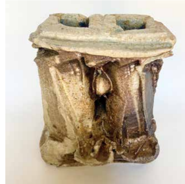
Twin trunk vase Wood ash & flame marked Stoneware Wood fired, 4 w x 22 d x 25 h