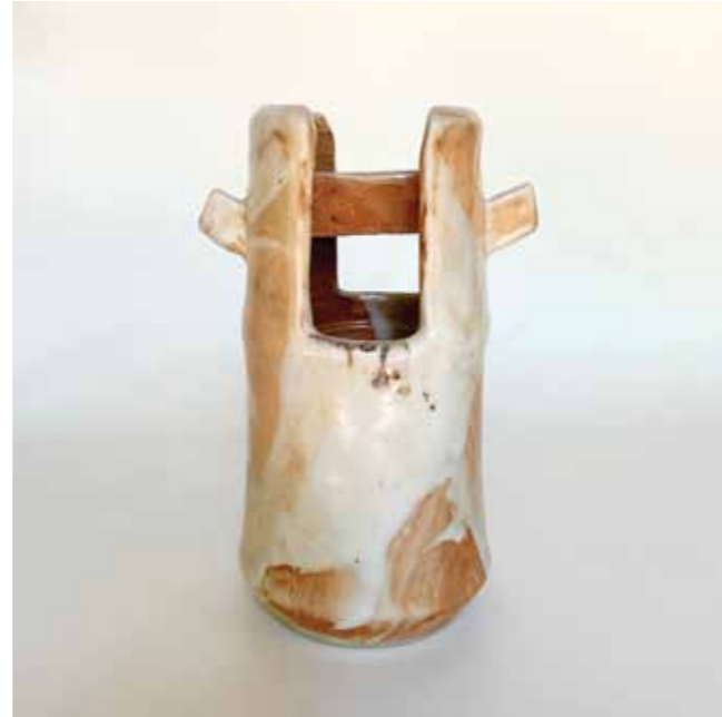
Flower pail 2 Shino glaze Stoneware Multiple firings, 12.5 d x 23 h