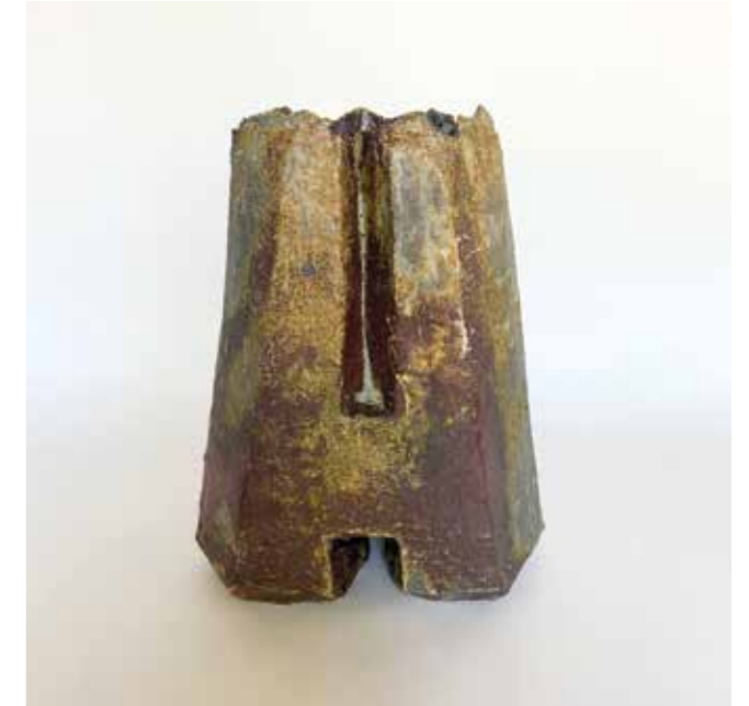
Earth twin vase Wood ash & flame marked Stoneware Wood fired, 8 w x 10 d x 23 h