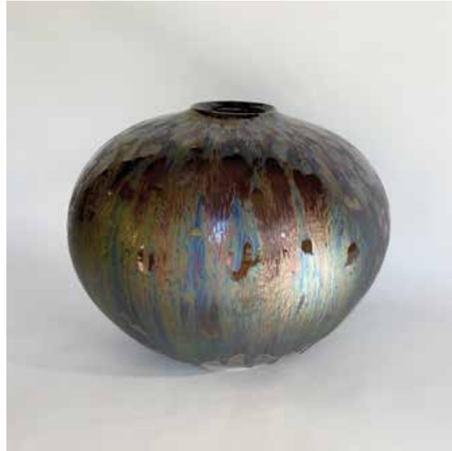
Ovoid orb Iridescent Tenmoku Porcelain Oxidised firing, 34 d x 28 h