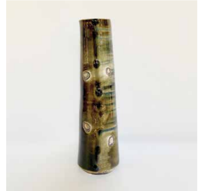
Biidoro (dragon eye) cylinder 6 Iron green & ash glaze, side fired on shells Porcelain Multiple firings, 12 d x 41 h