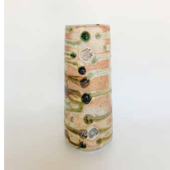
Biidoro (dragon eye) cylinder - 5 Shino & ash glaze, side fired on shells Stoneware Wood fired, 9 d x 22 h