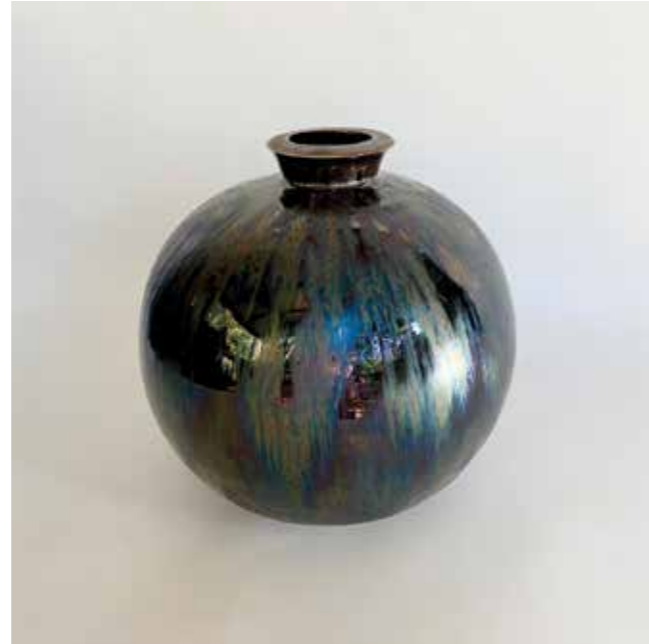
Collared jar - medium Iridescent Tenmoku Porcelain Oxidised firing, 21 d x 23 h