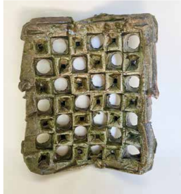
Square pegs & Round holes Wood ash glaze Stoneware Multiple firings, 31 w x 12 d x 37 h