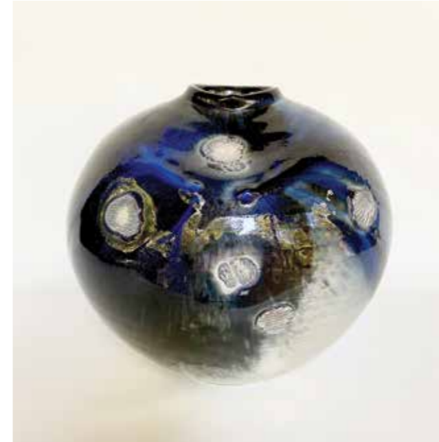
Medium orb - dark Cobalt, iron & ash glazes, side fired on shells Porcelain Multiple firings, 28 d x 27 h