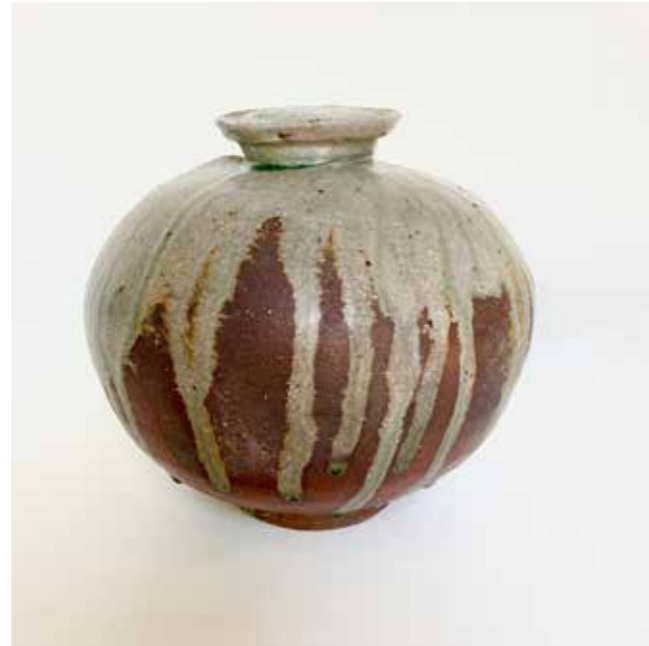
Iga style Round Jar 2 Wood ash & flame marked Stoneware Wood fired, 23 d x 21 h