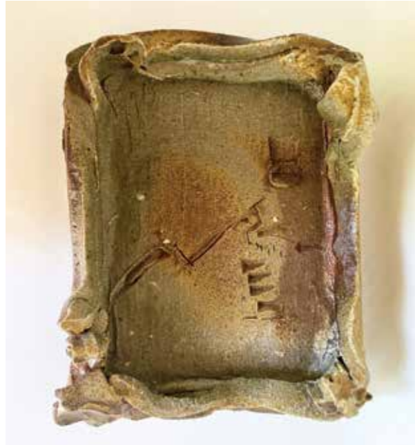
Earth cradle Wood ash & flame marked Stoneware Wood fired, 43 w x 31 d x 13 h