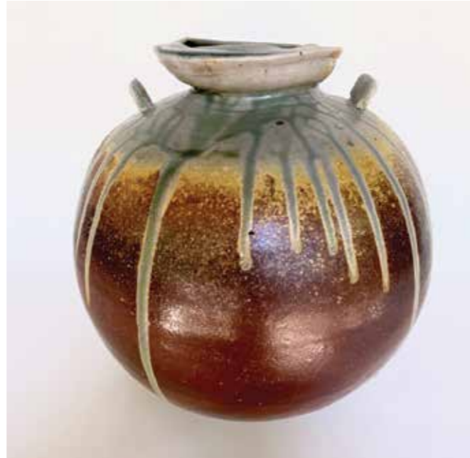
Iga style Round Jar 6 Wood ash & flame marked Stoneware Wood fired, 33 d x 34 h