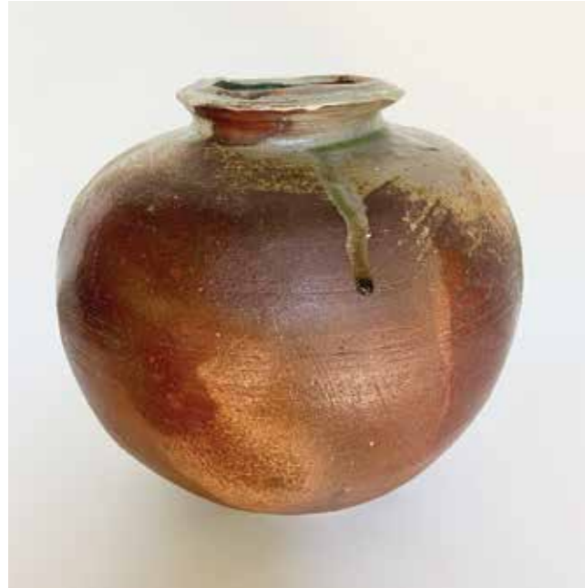
Iga style Round Jar 5 Wood ash & flame marked Stoneware Wood fired, 33 d x 31 h