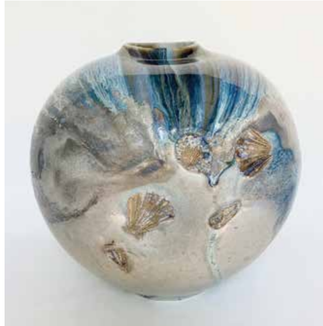
Large orb - pale Iron blue & ash glazes, side fired on shells Porcelain Wood fired, 36 d x 35 h