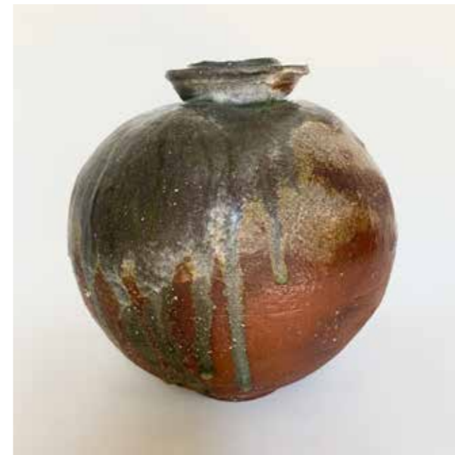
Iga style Round Jar 3 Wood ash & flame marked Stoneware Wood fired, 24 d x 25 h