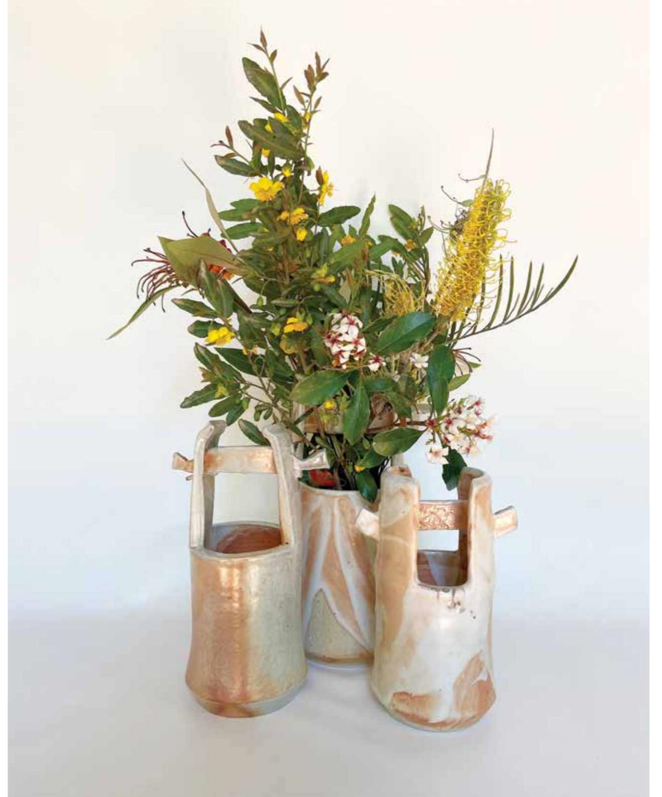
Flower pail 1,2 & 3 Shino glaze, Stoneware, Multiple firings 12 d X 19 h, 12.5 d x 23 h, 13 d x 26.5 h