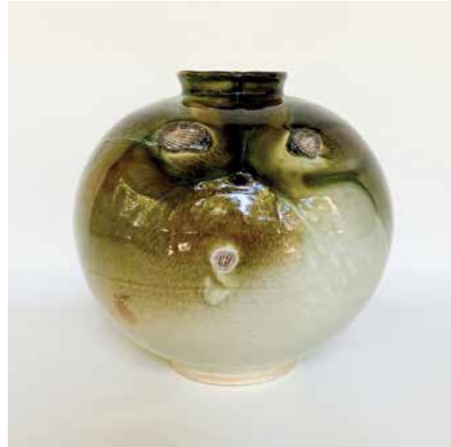
Collared jar - medium Iron green & ash glaze, side fired on shells Porcelain Multiple firings, 28 d x 27 h